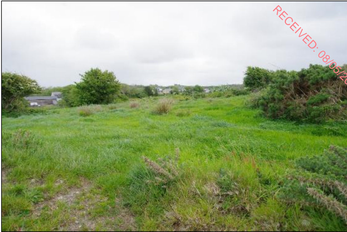
Plate 14.3: View of interior of ringfort CL057-037---- from north