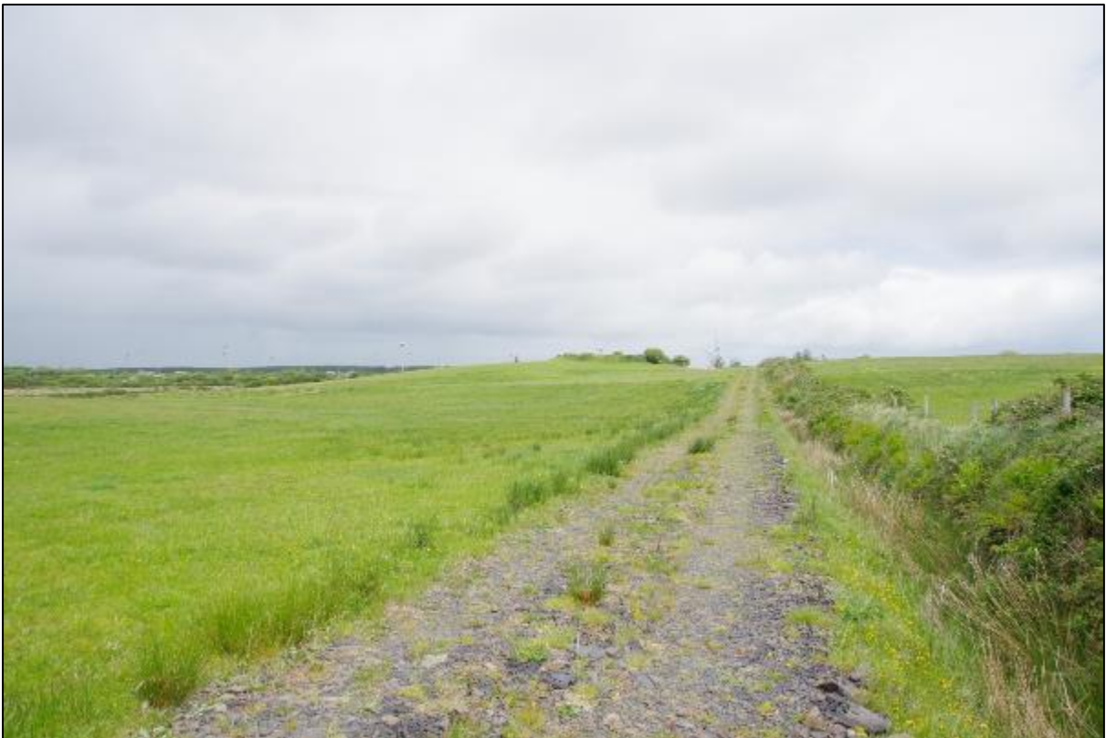
Plate 14.8: View towards location of onsite substation from southwest