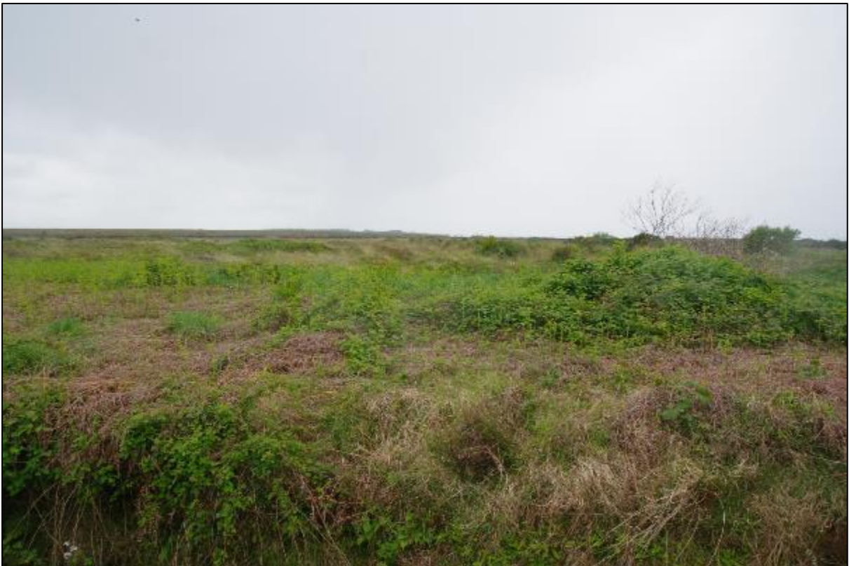
Plate 14.6: View towards location of Turbine 2 from east