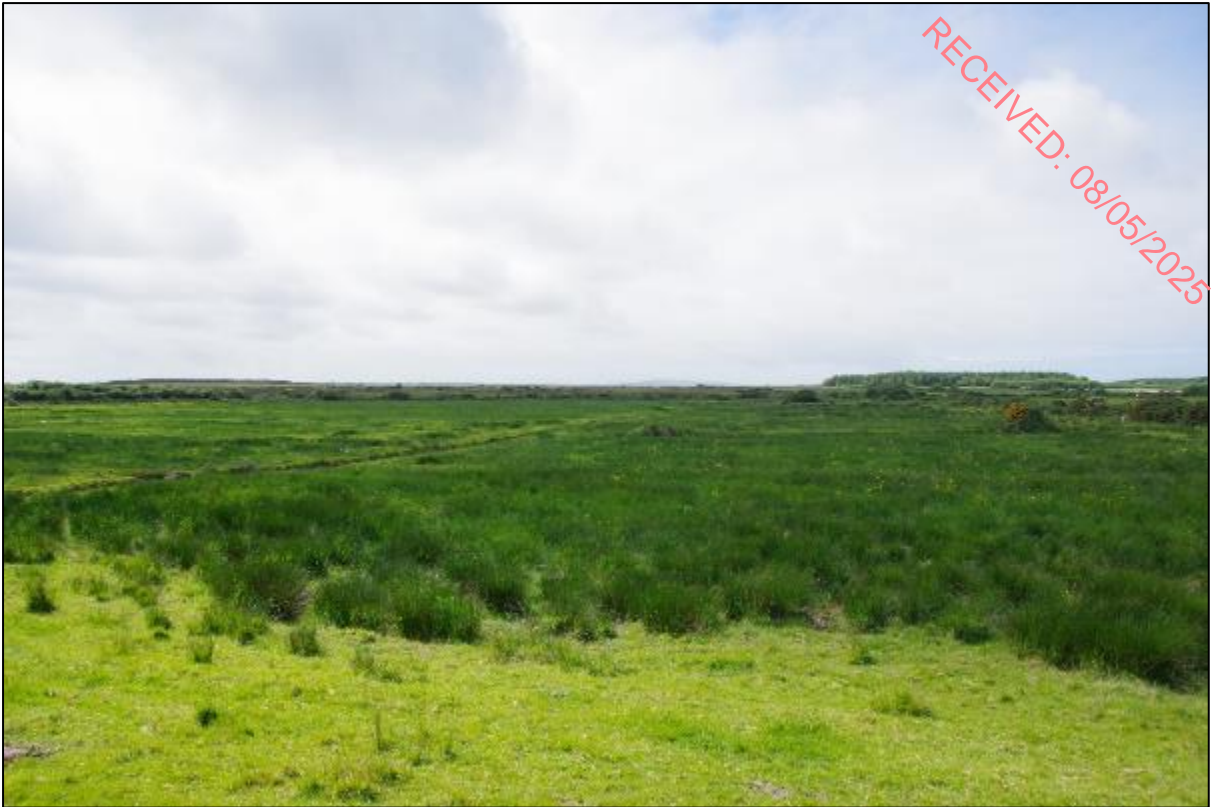
Plate 14.5: View of field containing Turbine 1 and flood compensation areas from east