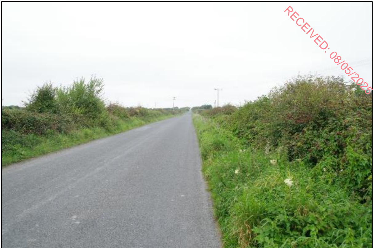
Plate 14.11: View of section of road along grid connection and turbine delivery route in Moanmore Upper townland