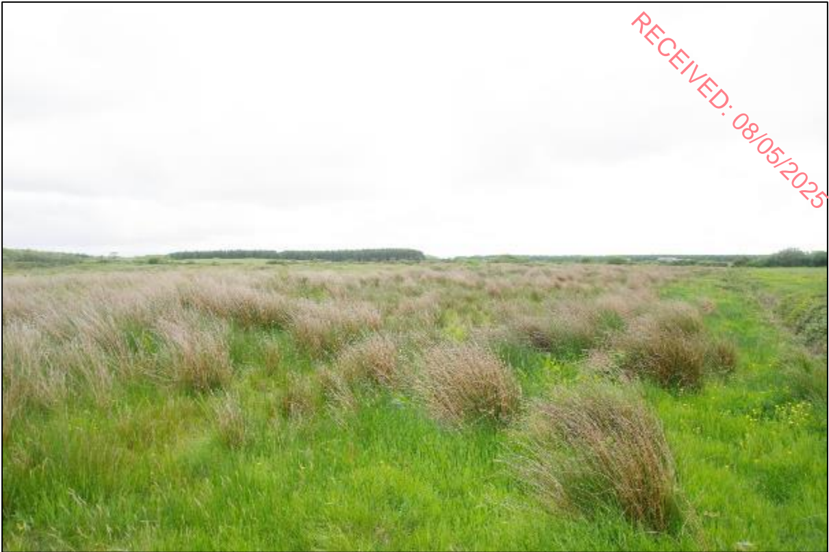
Plate 14.7: View towards location of Turbine 3 from north