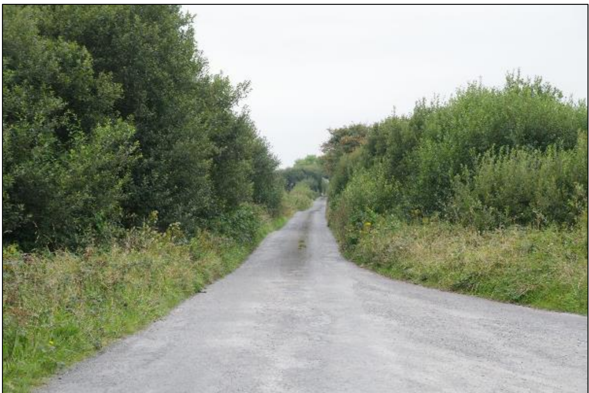
Plate 14.12: View of section of road along grid connection and turbine delivery route in Moanmore South townland