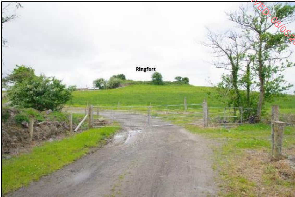
Plate 14.1: General view towards ringfort CL057-037----from east with existing farm track in foreground