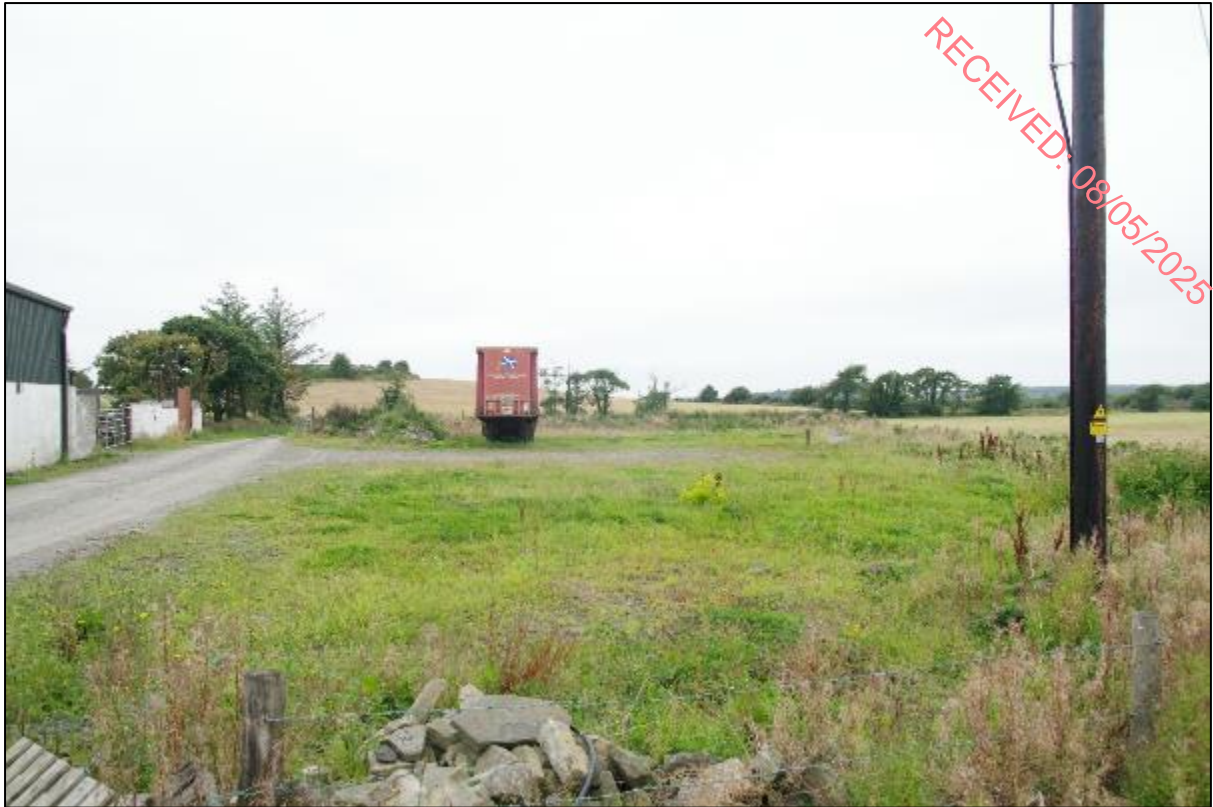
Plate 14.9: View towards location of temporary compound from east