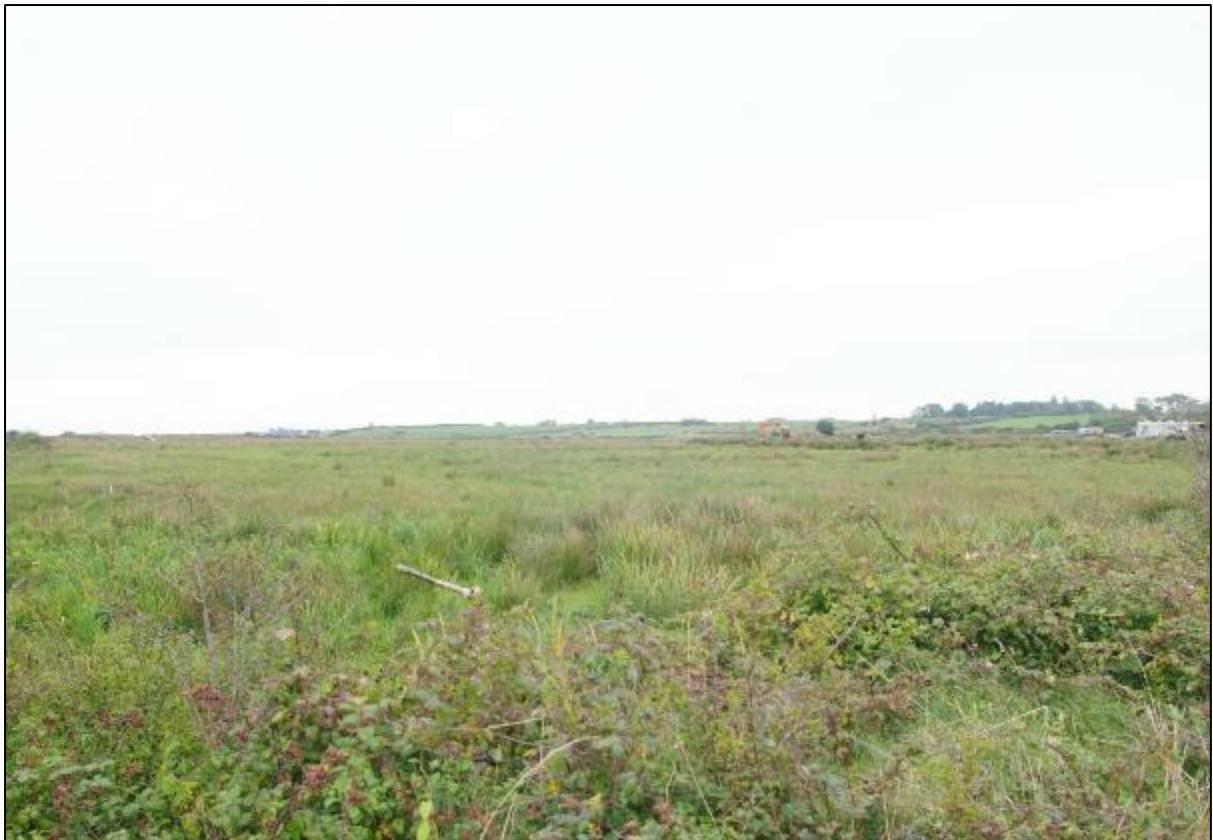
Plate 14.10: View towards location of spoil area from west