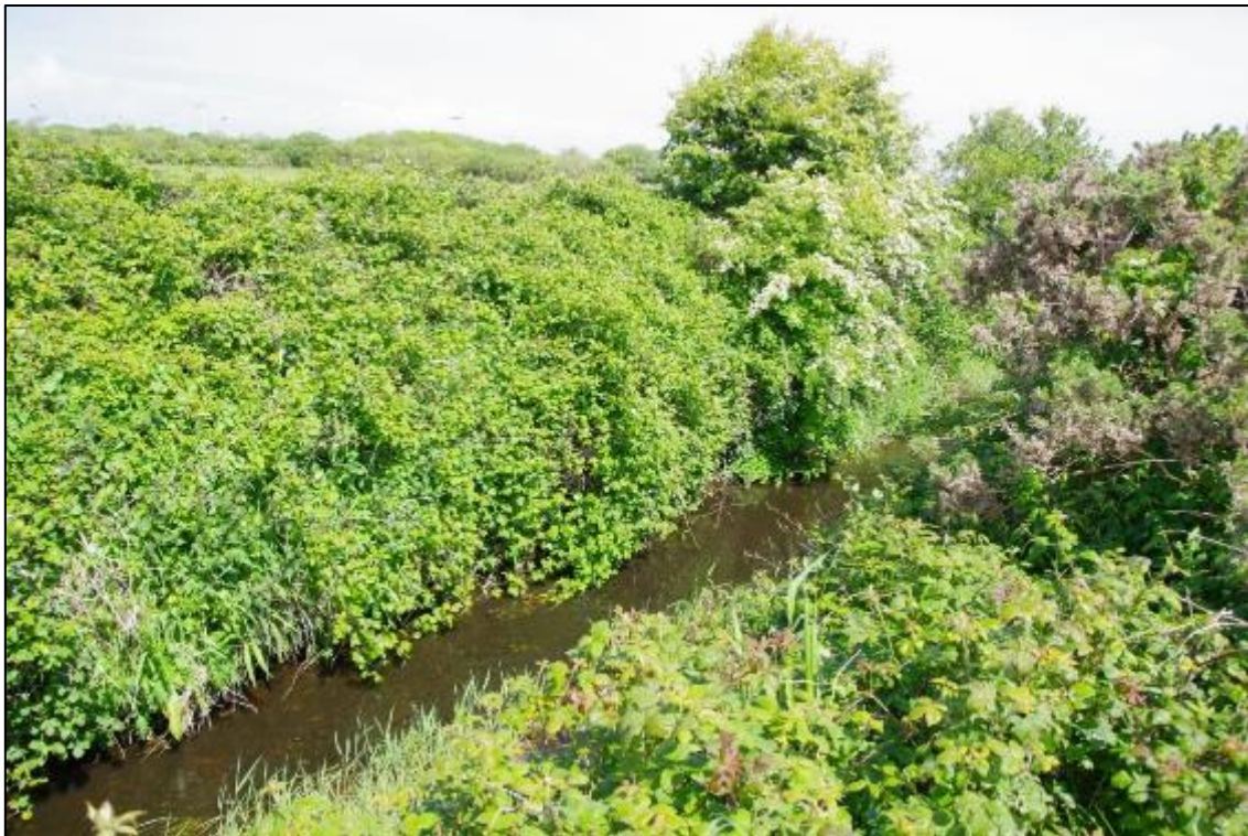
Plate 14.4: View of large drainage channel to south of Enclosure CL057-023---- from southwest